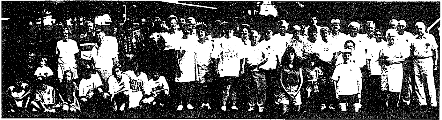
Group Photo - Schaefferstown, PA - 1995