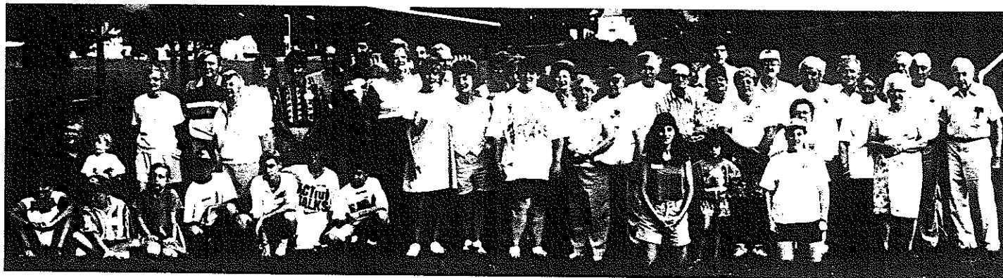
Group Photo - Schaefferstown, PA - 1995