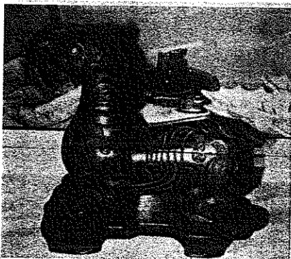
Unusual ancient animal whose head is removable to expose a lighter.