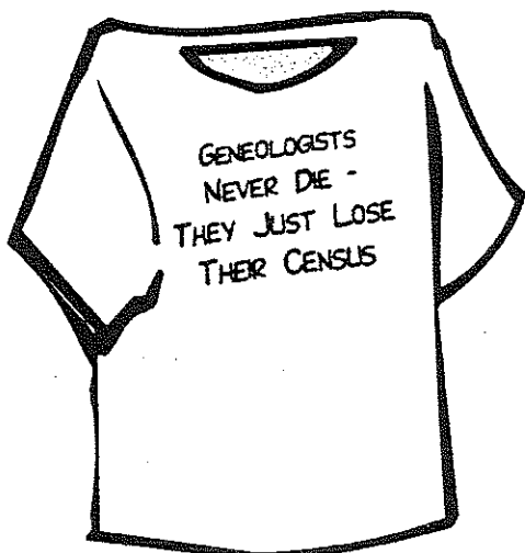
Reportedly seen on a T-shirt!

Respectfully submitted, your Historian, E. B. "Woody" Backensto